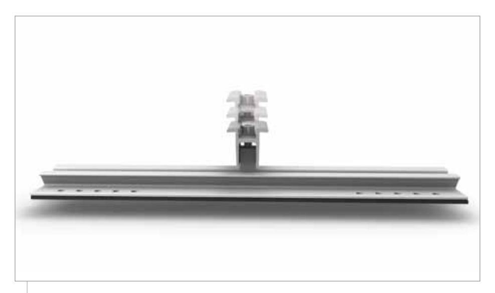
Detail illustration - MiniRail for module frames 35 - 50 mm